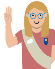
Ambassadors 11th & 12th

Girl Scout Seniors are ready to take the world by storm, and Girl Scouts gives them millions of ways to do it. Their experiences help to shape their world, while giving them a safe space to be themselves and explore their Interests. Girl Scout Seniors can earn their Gold Award (which, by the way, adds something ‘extra’ to college applications).