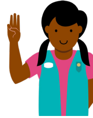
Juniors 4th & 5th

Girl Scout Brownies work together, earn badges, and explore their community. Friendship, fun, and age-appropriate activities begin at the Girl Scout Brownie meeting and move out to the community and wider world. While earning badges, they build skills, learn hobbies, and have fun!