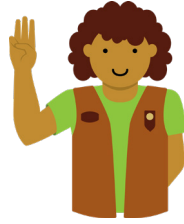
Brownies 2nd & 3rd

Girl Scout Daisies sparkle with that “first time ever” newness in everything they do. They go on trips, learn about nature and science and explore the arts and their communities—and so much more. Girl Scout Daisies can also earn Learning Petals and receive participation patches.