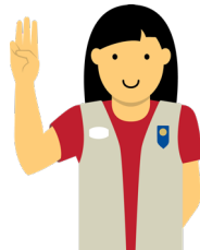
Seniors 9th & 10th

Girl Scout Cadettes chart their own course and let their curiosity and imagination lead the way. They learn about the power of being a good friend, gain confidence mentoring younger girls, and can earn the Silver Award.