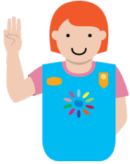
Daisies K & 1st

Girl Scout Daisies sparkle with that “first time ever” newness in everything they do. They go on trips, learn about nature and science and explore the arts and their communities—and so much more. Girl Scout Daisies can also earn Learning Petals and receive participation patches.